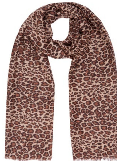
Makayla Leopard Print Scarf £12