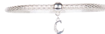
Victoria Initial Bracelet £10