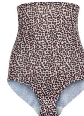
Leopard Print Smoothing Briefs £14