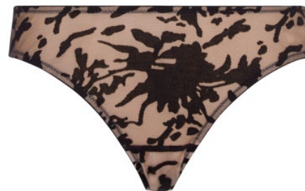
Burnout Floral Briefs £8