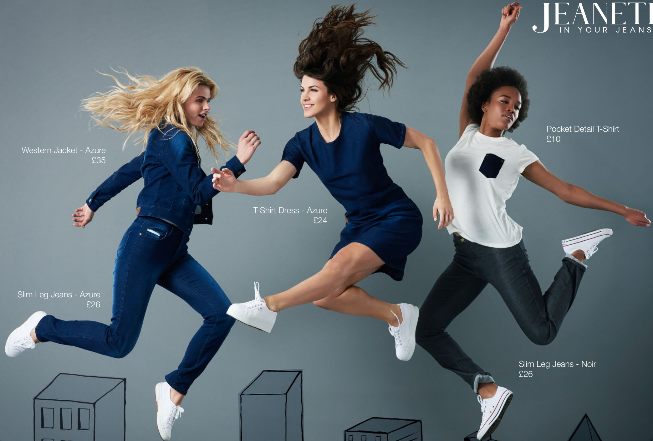
Western Jacket - Azure £35