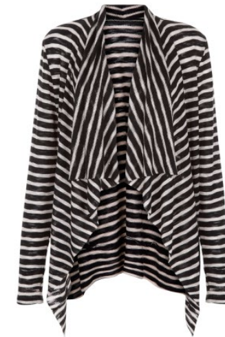
Monochrome Striped Waterfall Cardigan £25