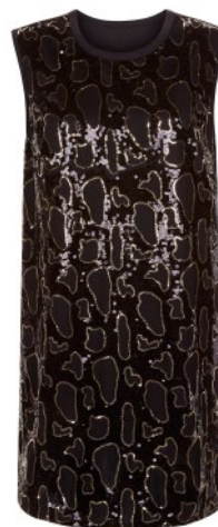
Sleeveless Sequin Tunic Dress £25