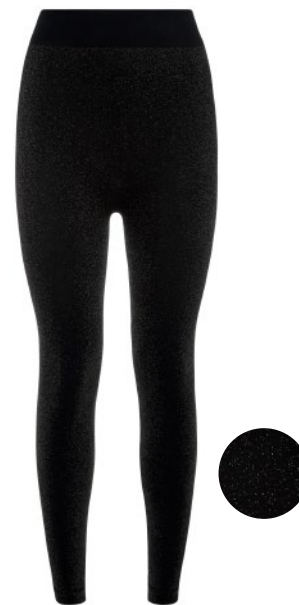
Body Illusions Rose Gold Sparkle Leggings £19