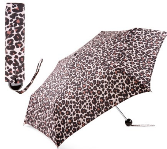
Makayla Leopard Umbrella £10