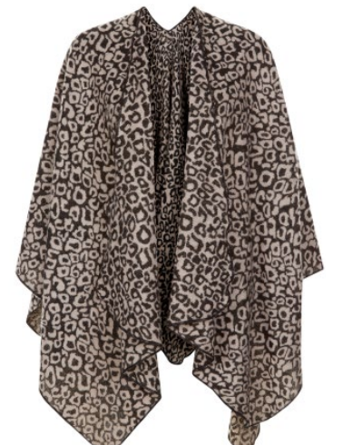
Makayla Reversible Leopard Cape £22