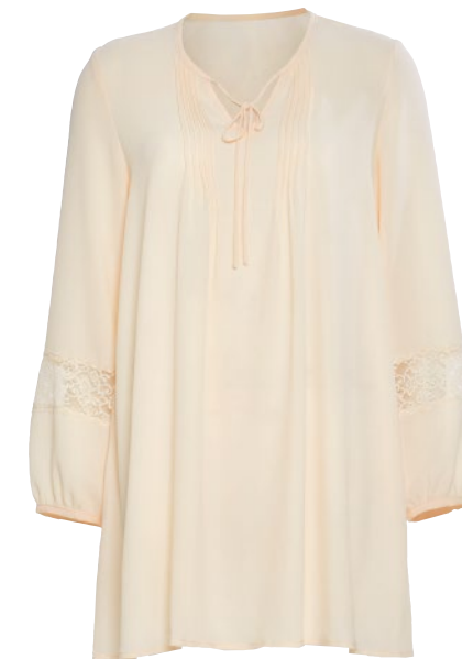
Boho Style Tunic Top £20