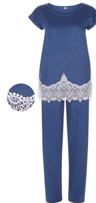
Denim Loungewear PJs £18