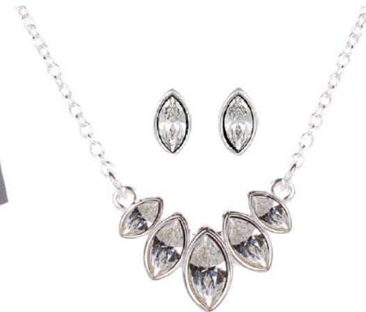
Beverley Giftset with Swarovski Crystals £15