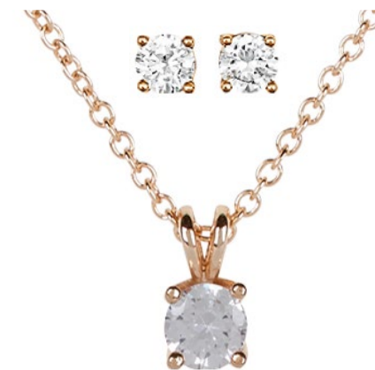
Jaimilynn Gift Set £10