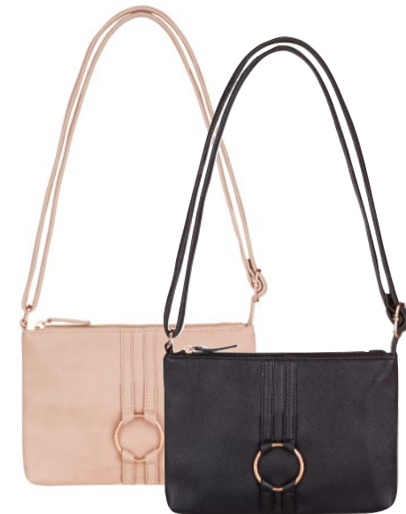
Jaylynn Cross Body Bag £10