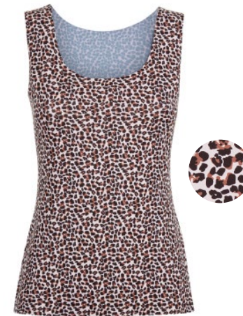
Leopard Print Smoothing Vest £15