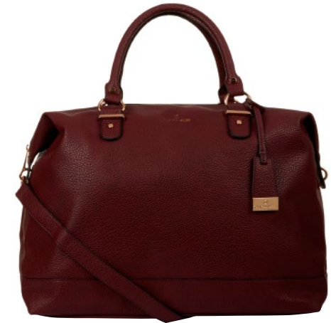
Oxblood Weekender £90