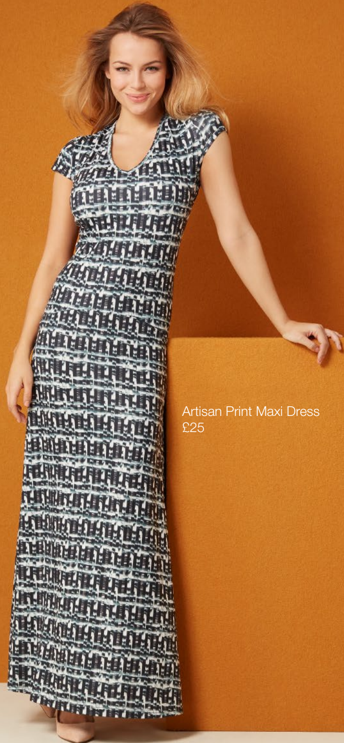
Artisan Print Maxi Dress £25