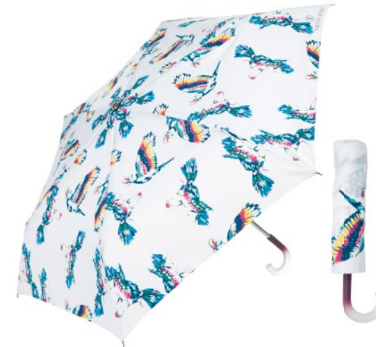
Morwenna Umbrella £20