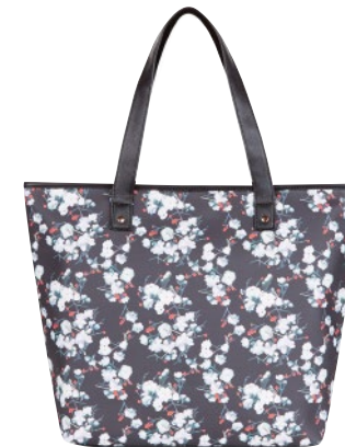
Corinne Floral Tote Bag £20