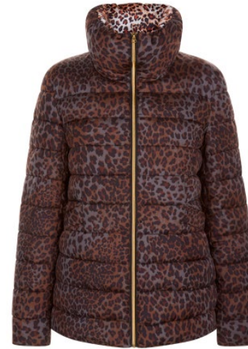
Leopard Padded Coat £40