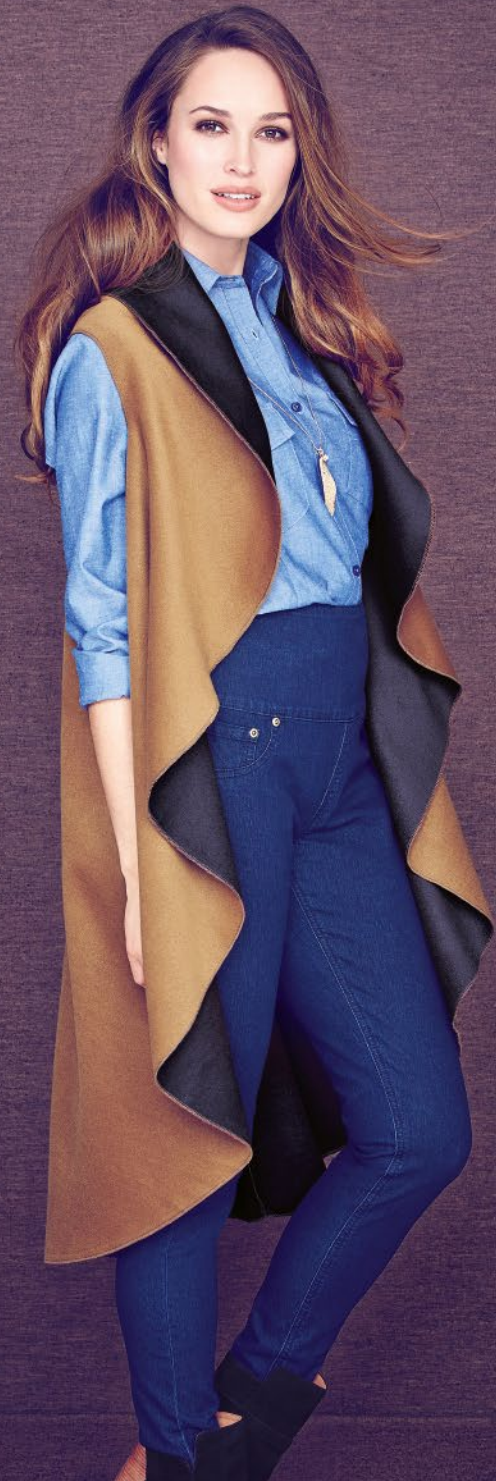
Reversible Waiscoat £28