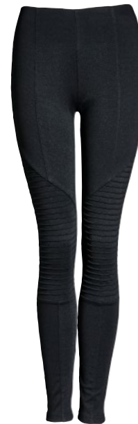
Black Pin Tuck Treggings £20