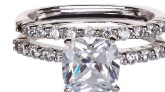
Hattie Diamondsque Ring Set £20