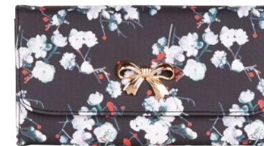
Corinne Floral Purse £15