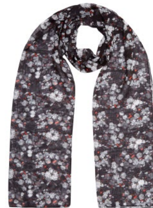
Corinne Floral Scarf £10