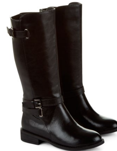
Chandra Riding Boots £50