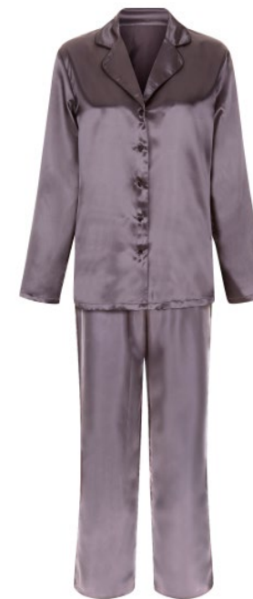
Noella Button Front PJs £16