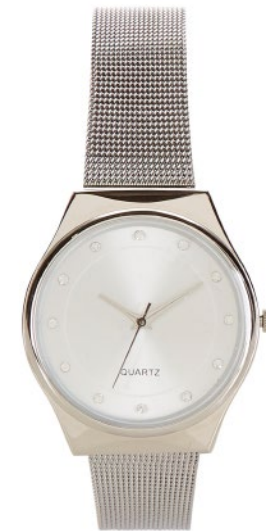
Isabelle Mesh Watch £20