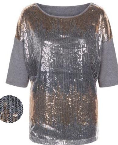
Batwing Sequin T-Shirt £22