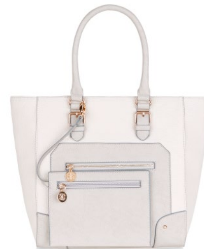
Allison Premium Tote Bag £30