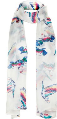
Silk Scarf £30