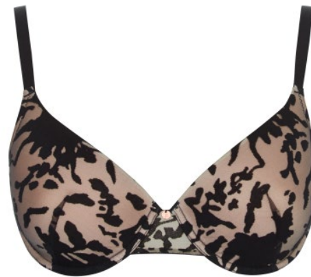
Burnout Floral Bra £14