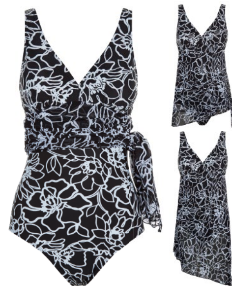
Club Caliente 3-in-1 Swimsuit £24