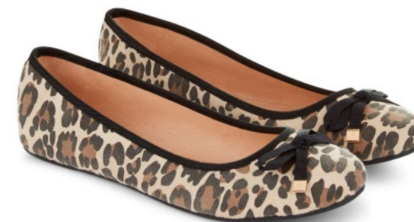
Makayla Leopard Print Ballet Shoes £25