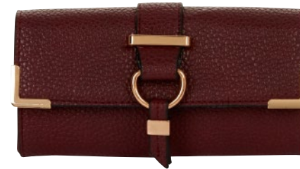
Oxblood Purse £30