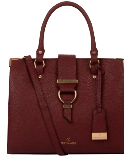
Oxblood Handbag £80